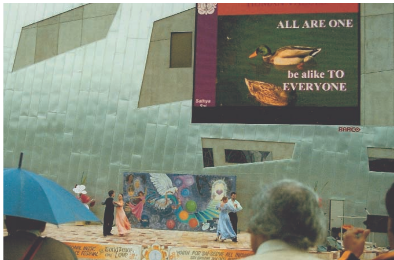
SAI ORGANISATION AT FEDERATION SQUARE MELBOURNE (left)

The Youth-For-Sai hosted a National Festival for Dance & Music at Federation Square, Melbourne - one of the Nation's most prominent landmarks. The theme of the festival was WORLD PEACE & LOVE