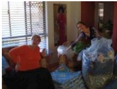
One half of a sewn quilt: