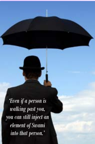
'Even if a person is walking past you, you can still inject an element of Swami into that person.'